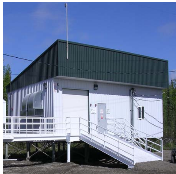
Figure 1: Stevens village Power Plant

925 Plum St SE, Bldg 4 • P.O. Box 43165 • Olympia, WA 98504-3165 (360) 956-2004 • Fax (360) 236-2004 • TDD: (360) 956-2218