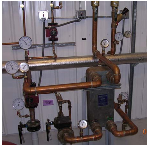
Figure 3: Heat Recovery System

A combination of “marine jacketed” and “non-marine jacketed” generators are used to meet the electric demand and to maximize recovered heat potential, and provide excellent fuel economy.