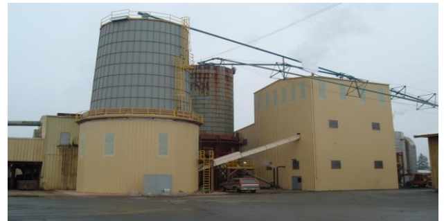
Rough and Ready's CHP Biomass Plant

TYPE OF INDUSTRY: Lumber mill LOCATION: Cave Junction, OR TYPE OF SYSTEM: Wood waste combined heat and power STEAM BOILER: Wellons water tube PRIME MOVER: Coppus Murray backpressure steam turbine (Model "U") ELECTRIC GENERATING CAPACITY: 1.5 MW AVG. ELECTRIC LOAD: 1.28 MW AVG. THERMAL LOAD: 58.5 MMBtu/hr. FUEL: Hog fuel (50%), forest thinnings and logging debris (50%) USE OF THERMAL ENERGY: Heat for 12 double-track dry kilns to dry more lumber SYSTEM EFFICIENCY: 68% NET CAPACITY FACTOR: Approx. 80% EMISSIONS OFFSET: Power sold to grid - 7182 MT/yr CO 2 e and an 85% particulate reduction with new electrostatic precipitator (Source for CO 2 calculation: EPA website) ENVIRONMENTAL BENEFITS: Natural gas offset by wood waste INSTALLED COST: $6 million SIMPLE PAYBACK: 4 years OPERATION START: February 2008