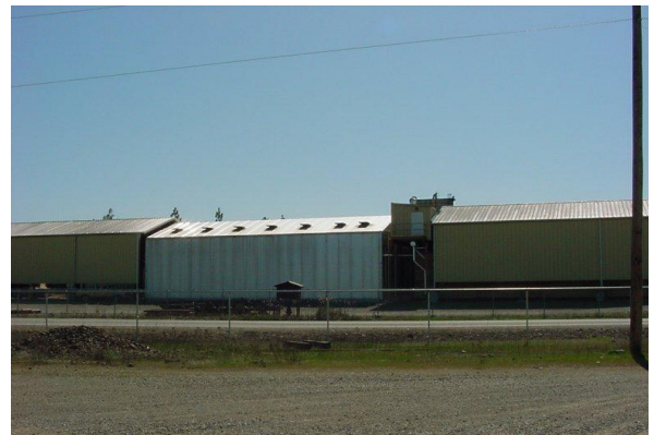
Wellons lumber dry kilns