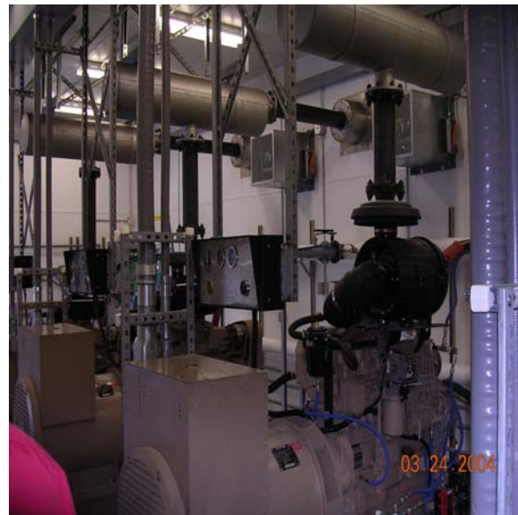
Figure 1: Kokhanok Power Plant

925 Plum St SE, Bldg 4 • P.O. Box 43165 • Olympia, WA 98504-3165 (360) 956-2004 • Fax (360) 236-2004 • TDD: (360) 956-2218